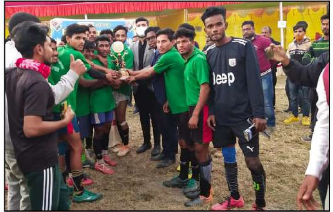
Winner of Football Competition