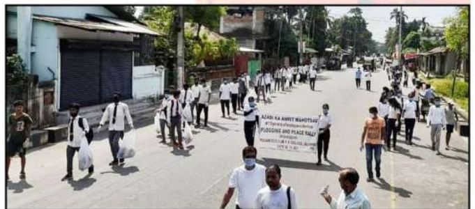
Students participating in Plogging and Peace Rally Date : 2nd October 2021