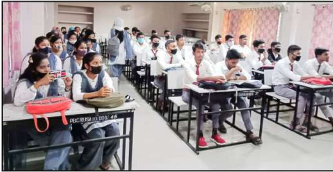
Constitution Day, Date : 26-11-2021