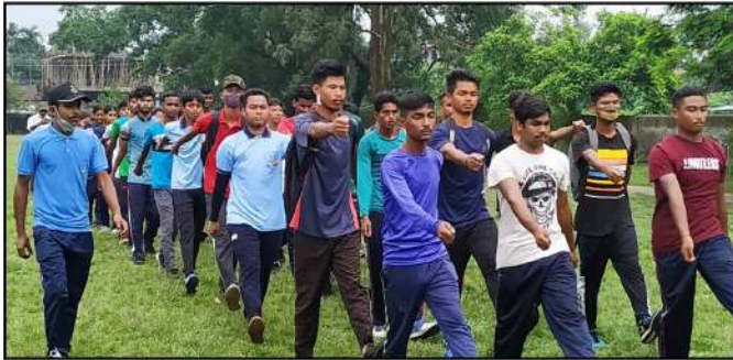
P.B. College NCC Drill