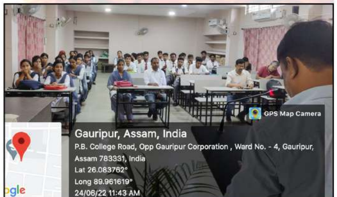
Recitation Competition, Date : 24th June 2022