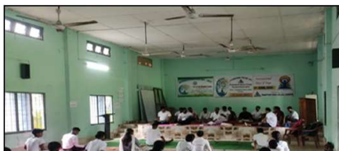
At Auditorium hall on 21.06.2022