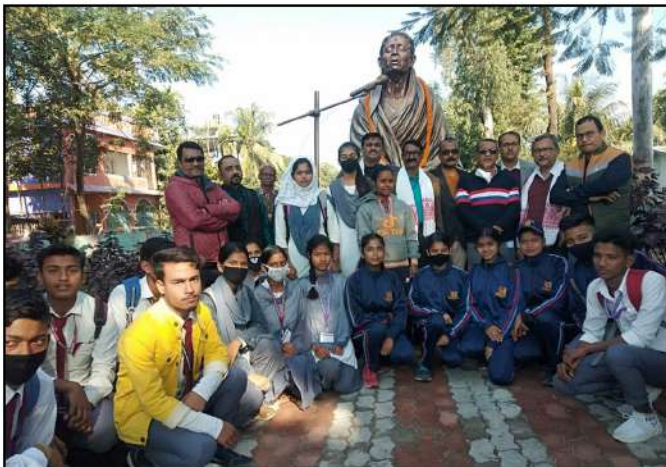
Death Anniversary of Padma Shri Pratima Barua Pandey Date : 27th December 2021