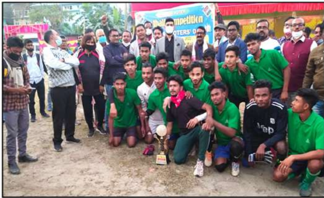
The Winner Team of the college