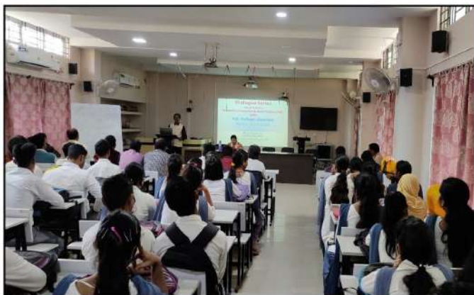
Students participating in Dialogue Series organised by Reserch, Innovative & Best Practices Cell, IQAC P.B. College, Gauripur Date : 4th March 2020