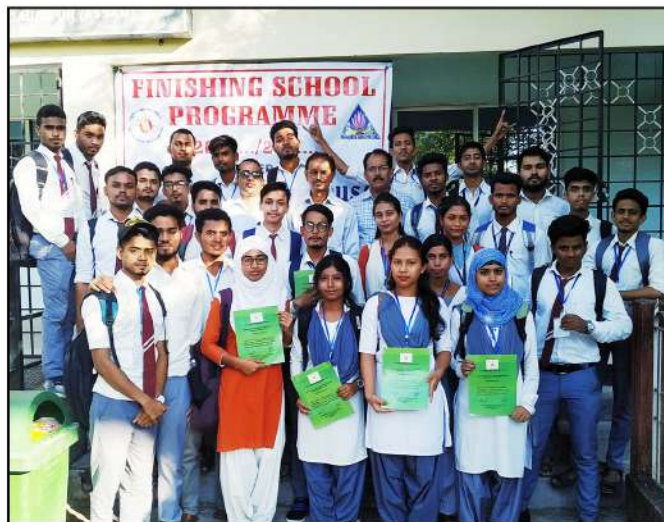
Finishing School Programme Date : 14th November 2019