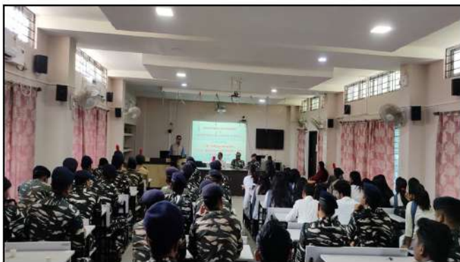
Awareness Programme on Covid-19 on 8th March 2020