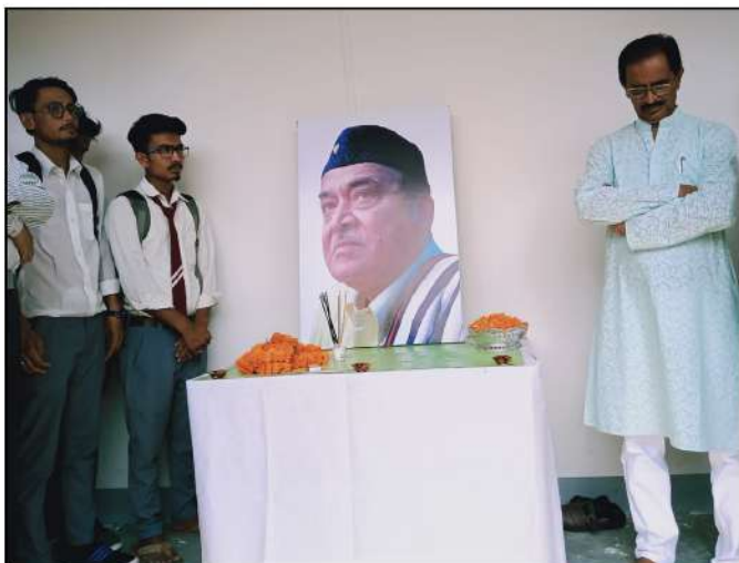
Death Anniversary of Padma Shri Dr. Bhupen Hazarika Date : 15th November 2019