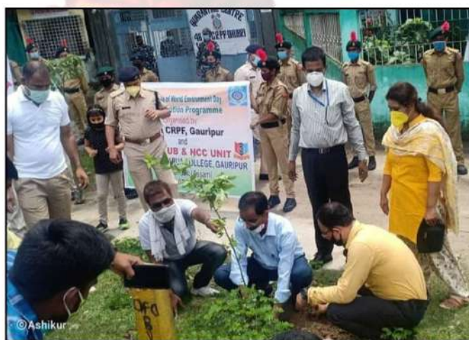
Plantation Programme Date : 5th June 2020