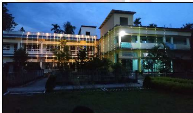
Illumination of college building on the occasion of Independence Day 2019