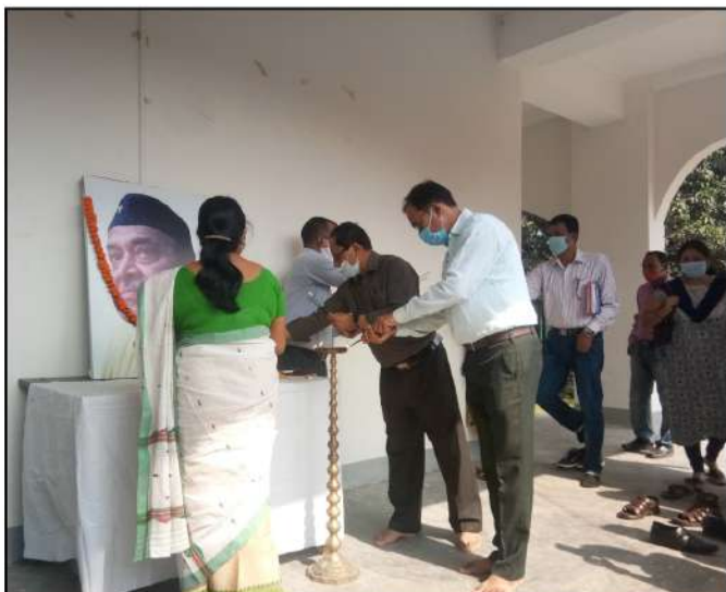
Death Anniversary of Padma Shri Dr. Bhupen Hazarika Date : 15th November 2019