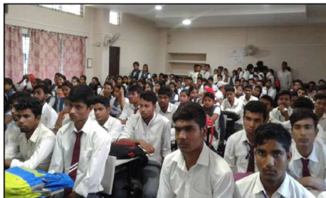
Students participating in Deeksharambh : Student Induction Programme Date : 26th & 27th September 2019