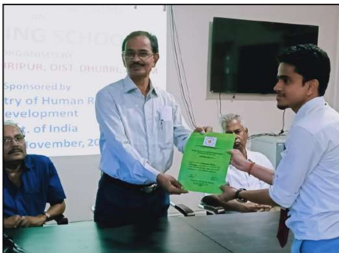
Finishing School Programme Date : 14th November 2019