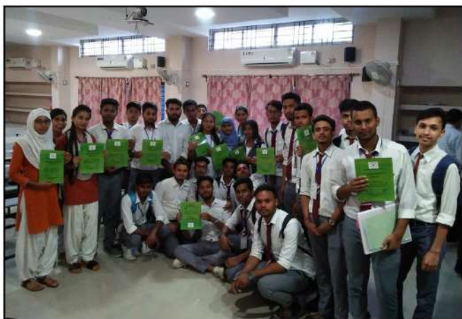
Finishing School Programme Date : 14th November 2019