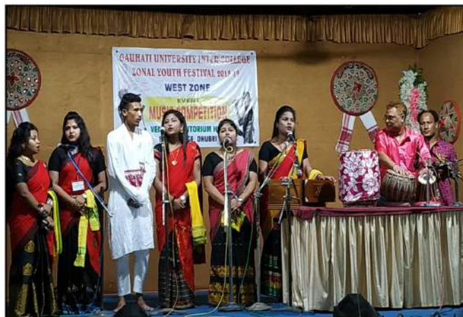
Students of P.B. College participating in Gauhati University Inter College Zonal Youth Festival held on 27 June 2019 at B.N. College, Dhubri