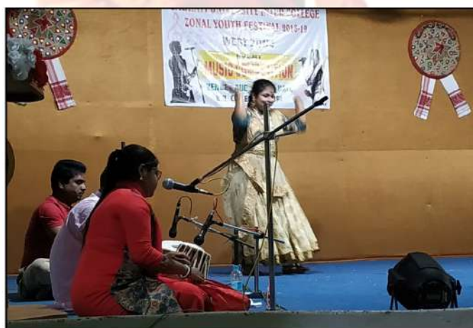
Students of P.B. College participating in Gauhati University Inter College Zonal Youth Festival held on 27 June 2019 at B.N. College, Dhubri