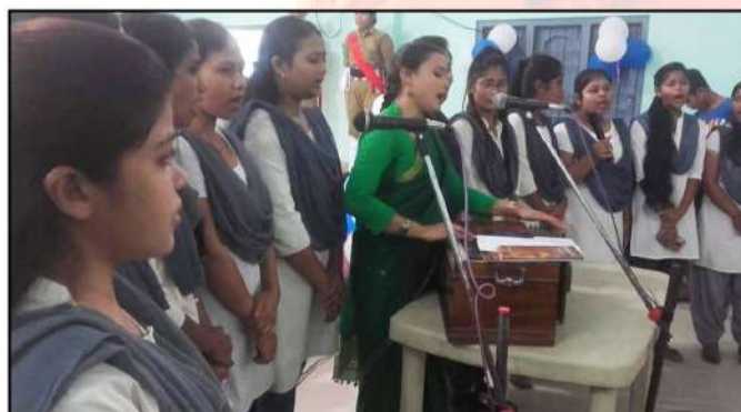
Students singing Corus in a programme held in P.B. College during the session 2018-19