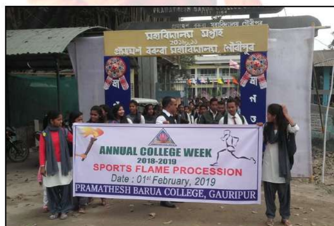
Sports Flame Procession on the occasion of Annual College Week, 1st February 2019