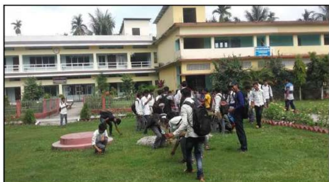
Campus Cleaning held on 2nd October 2019