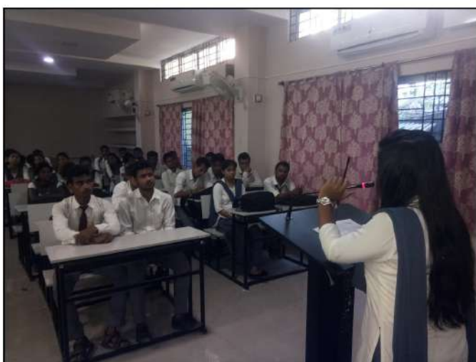
Students participating in "Students Induction Programme" held on 22 September 2018