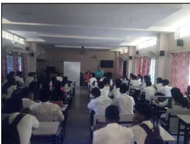
Students Induction Programme held on 22 September 2018