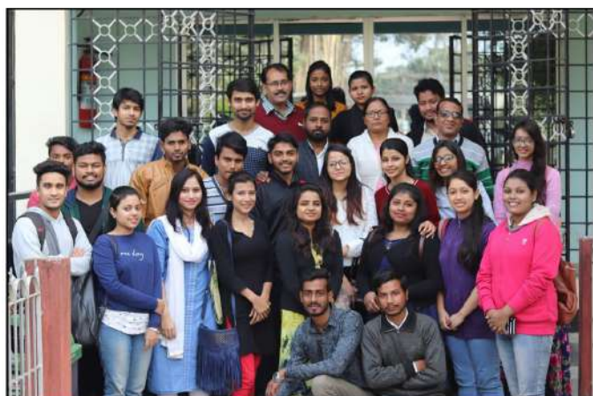
NSD Workshop held on 23rd, 24th & 25th January 2019