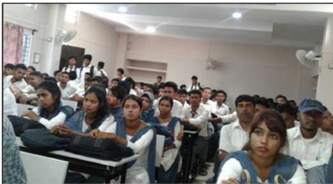
Students of the college attending the programme on 28.08.2018