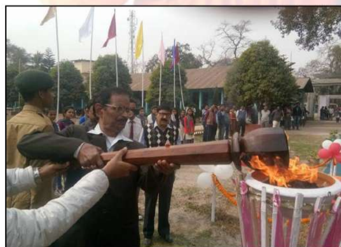
Sports Flame Procession on the occasion of Annual College Week, 1st February 2019