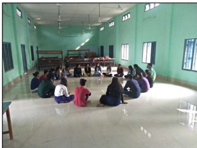
NSD Workshop held on 23rd, 24th & 25th January 2019