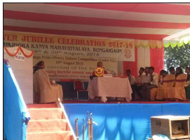
Students of P.B. College, Gauripur participating in Debate Competition (Under Gauhati University) at Birjhora Kanya Mahavidyalaya, Bongaigaon on 19th and 20th August 2018