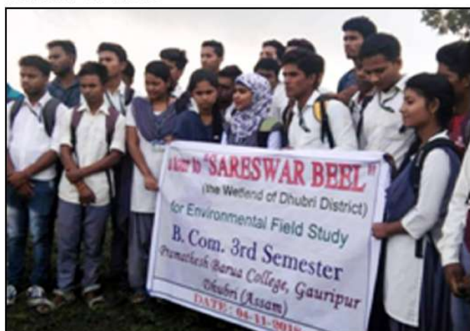
Students of B.Com 3rd Semester